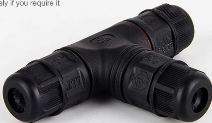
mini T 3-channel and 3-core waterproof connector(IP68)

Note: this pack products not include accessories, Please purchase separately if you require it