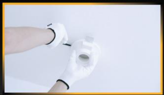
3. Cut out the hole in the ceiling.